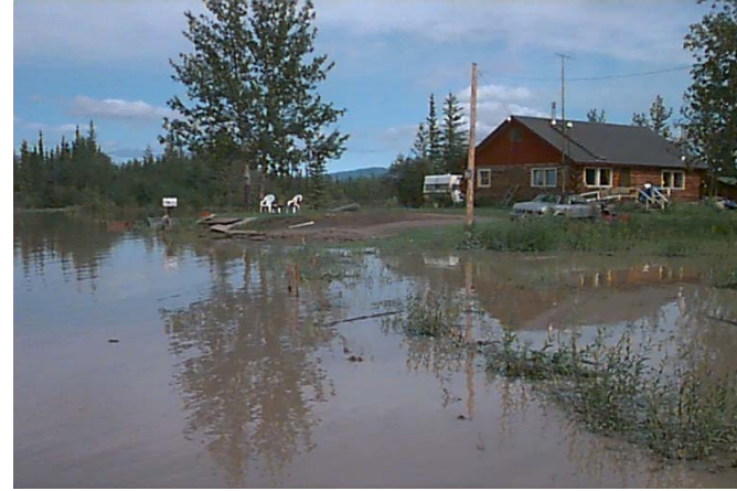
Photo 2: High water near Northway Village, photo courtesy of Michael L. Bird, November 2, 1998.