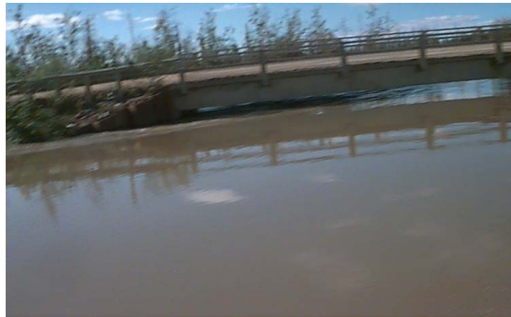
Photo 3: Bridge near Northway Village, November 2, 1998 flooding, photo courtesy of Michael L. Bird.