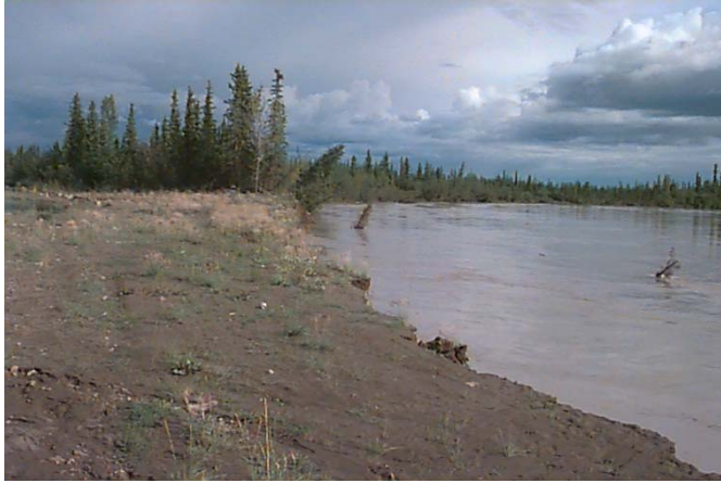
Photo 1: Nabesna River at Northway Village close to the road, photo courtesy of Michael L. Bird, November 2, 1998.